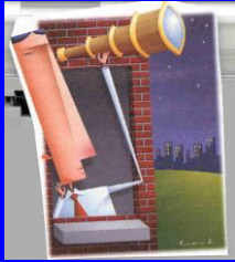
Final Consultant Report