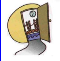
RFP Respondents & Info