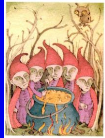
Letter Confirming Presentation Selection