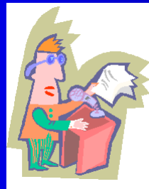
Outline for Presentations