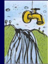
RFP Proposal Evaluation Guidelines