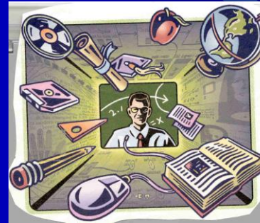
Do your Homework