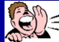
Not Selected Next Phase Letter